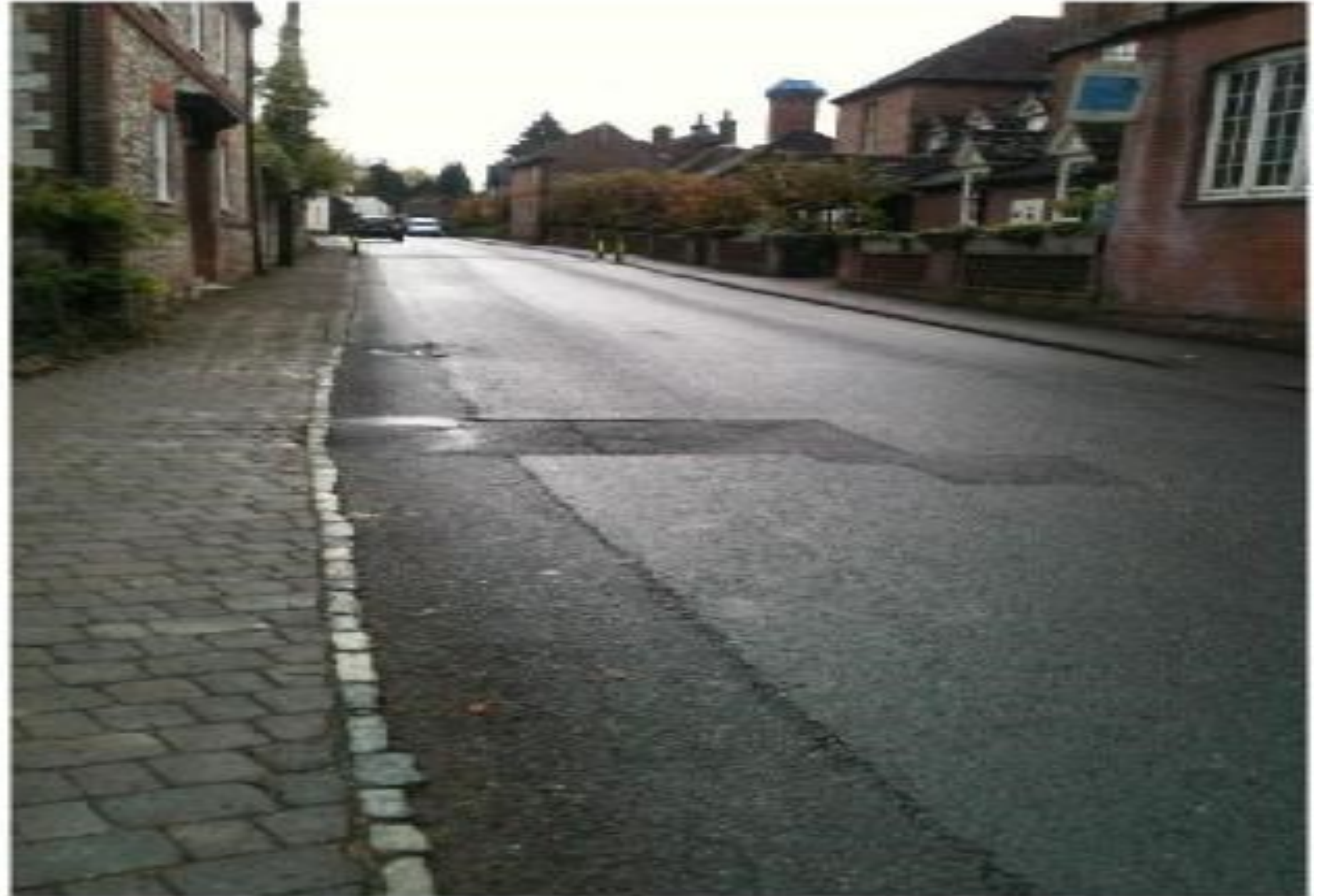
Figure 1. Selborne High Street opposite Gilbert Whites House showing informal crossing point

It is suggested that the footways through the village are considered to be narrow (Figure 3) and pedestrians were observed as having to walk single file along a majority of the High Street. The widening of the footways would assist in accommodating the high numbers of pedestrians that pass through the village, generally visiting Gilbert White's House. The improvements will also improve the continuity of the pedestrian route to and from the school. During a site visit it was noted that the presence of a large van near the entrance to Gilbert Whites House did not significantly affect traffic movements. It is therefore suggested that the carriageway could be reduced in width to a minimum of 4.8m and the footway between Gilbert Whites House and the Selborne Arms should be widened to a minimum of 2.0m. The existing informal crossing should be retained but the carriageway narrowed to 3.0m to reinforce the informal priority working, (drawing number ATK-HGN-SEL-DR-D-0002).